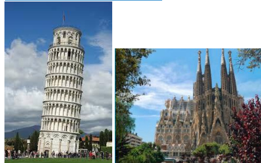
Leaning Tower of Pisa Sagrada Familia