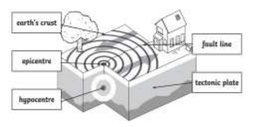
Features of an earthquake