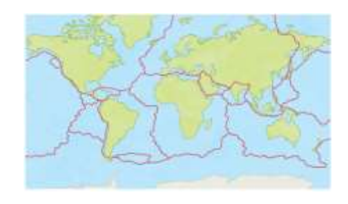
Location of plate tectonic boundaries