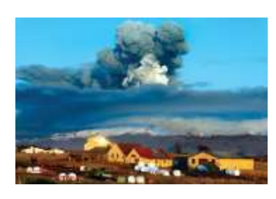
Iceland, 2010 volcanic eruption.