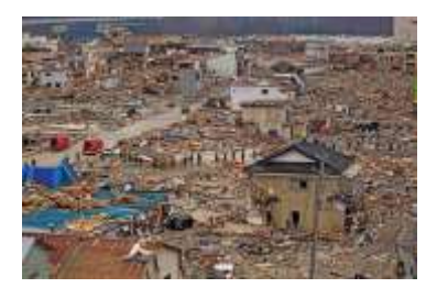
Japan, 2011, after earthquake.