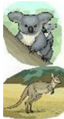
Bush characters in a story from Australia

Each of these animals in fiction has its own character, but each one has links with facts about the animal in real life.