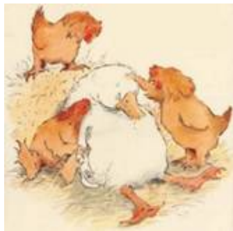
A duck in a story from England