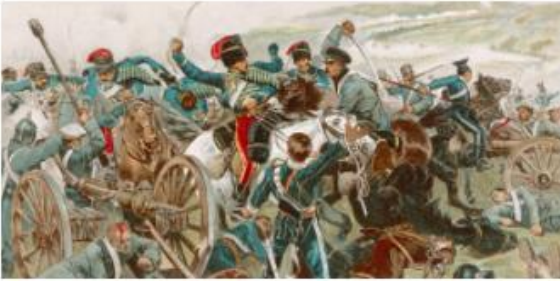
A painting depicts the Charge of the Light Brigade during the Crimean War.

The Crimean War was fought between 1853 and 1856. It was fought in the Crimea , an area in the south of Russia at the time (now part of Ukraine). On one side were Britain, France, and Turkey, and on the other side was Russia.